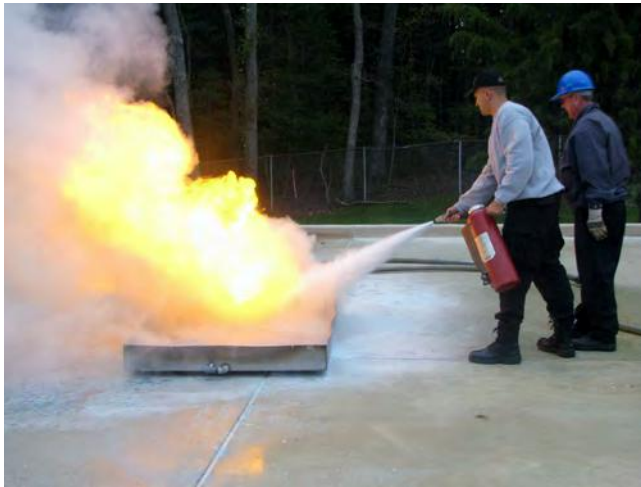
Delaware State Police Recruit Class

Delaware State Fire Chiefs Dept. of Agriculture—Forestry Division DE State Police Helicopter DE Air Rescue Team State Fire Police DE Academy of Public Safety