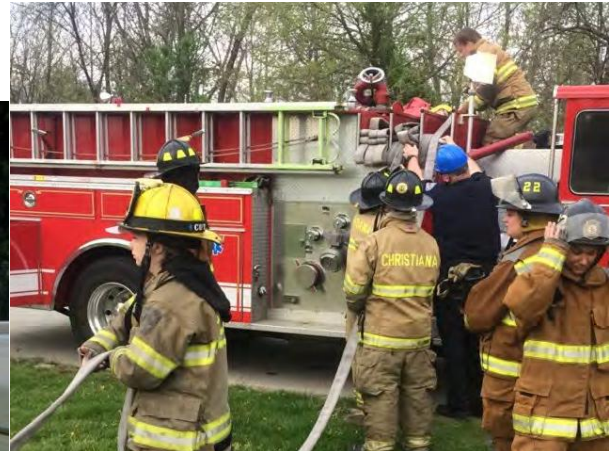
Delaware Academy of Public Safety Class