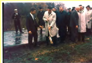
The current Classroom and Administration building bears little resemblance to

During the mid 1970's four pole shed type classroom structures were erected on the drill grounds. These outdoor student areas are equipped with chalkboard and electricity. During 1978 a new training area was constructed as the Flammable Gases Training Area, located between the pump house and the Liquids Training Area.