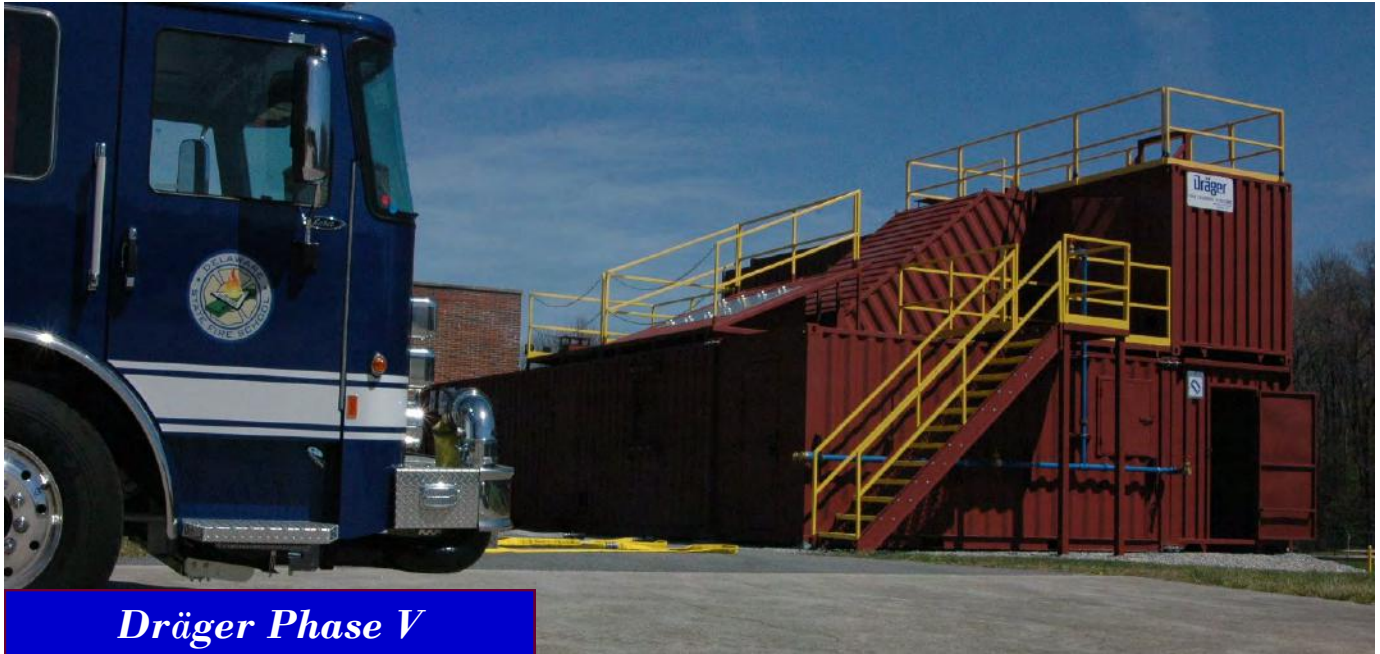
Dräger Phase V