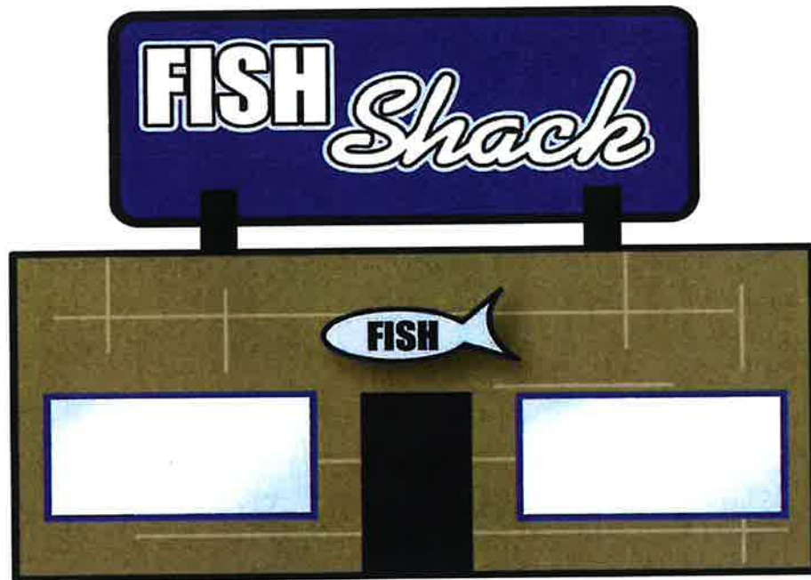
9120 WEST OLIVE AVENUE Front View